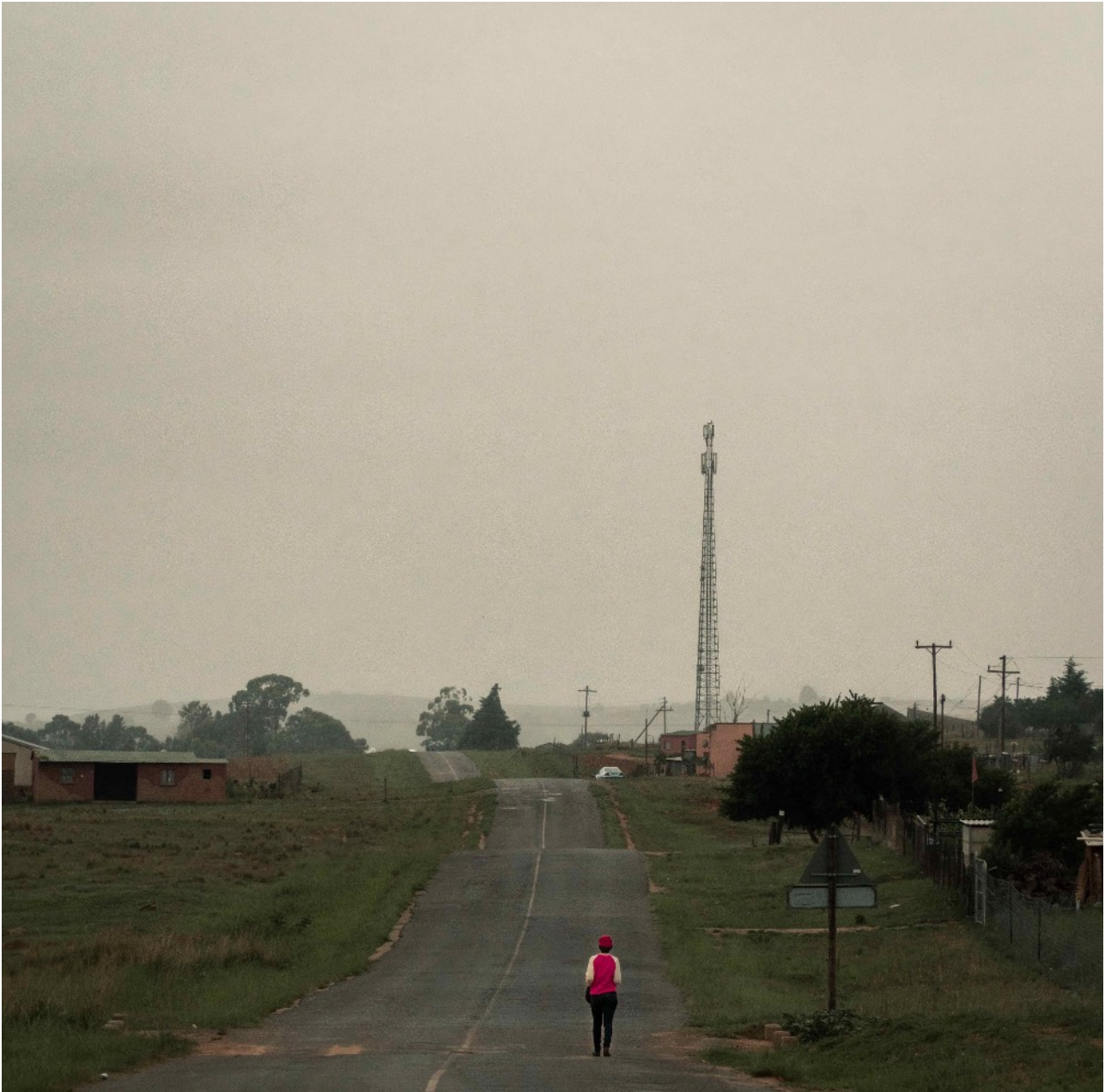
main road leading into Amazizi village