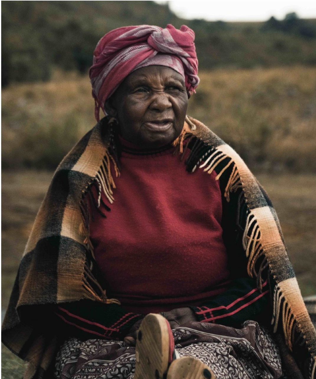
A traditional Zulu basket & mat weaver