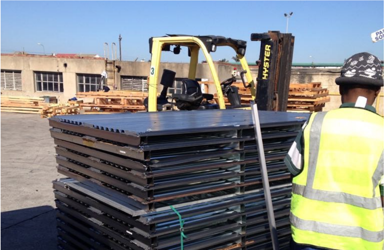
recyclable metal sheeting awaits for re-use