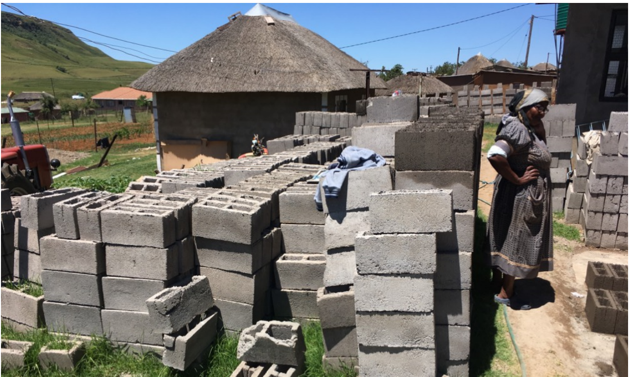
A concrete block business owner in Amazizi village