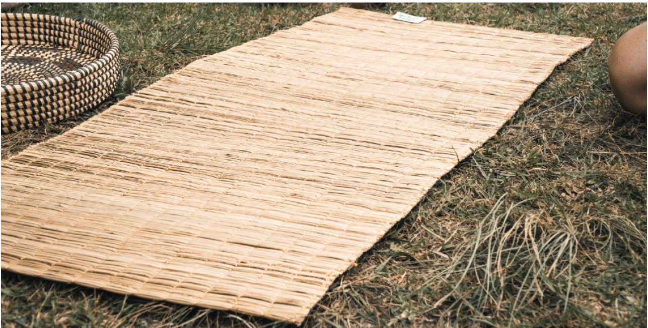
Zulu mats made from dried reeds

Cultural sustainability: The project will be achieved through incorporating the local community in the construction and maintenance of the structure. This will be achieved through: