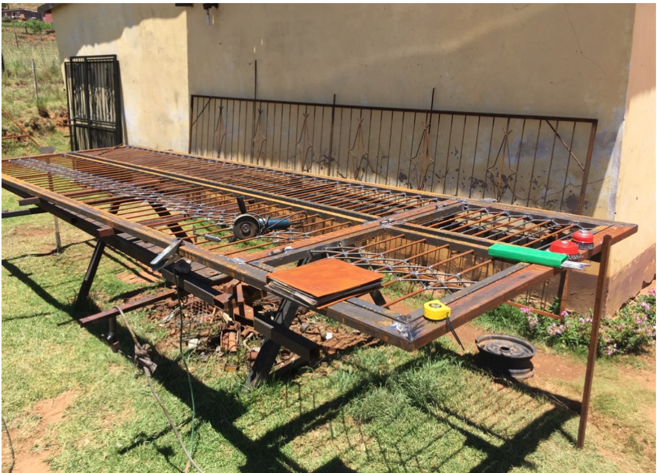
some typical metal work in Amazizi village

In general there seems to be limited accommodation options in the area, with the closest to the further consecution site being; Tugela Falls Bed & Breakfast, Cannidales Accomodation Place and Tower of Pizza.