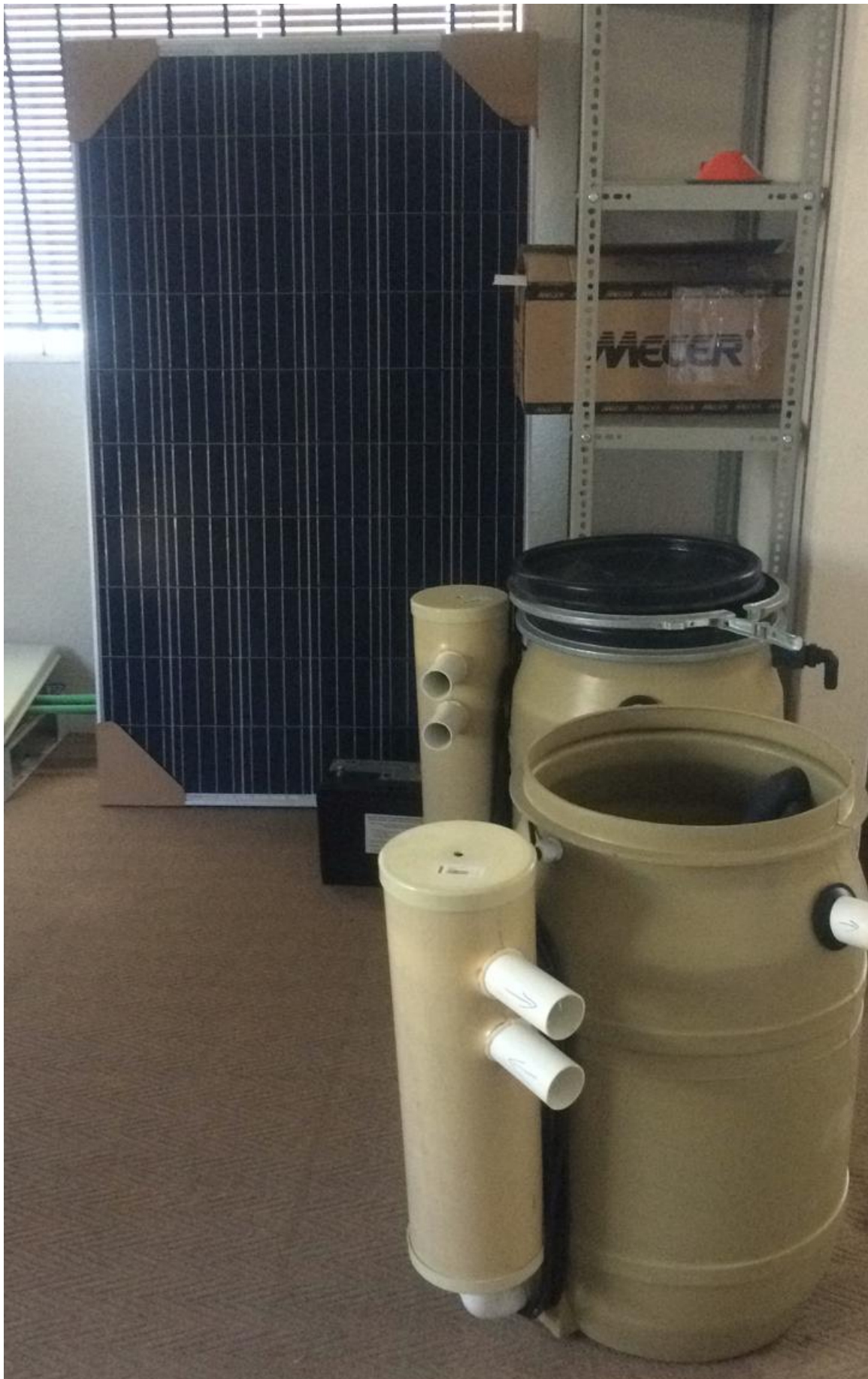
identified integrated solar and grey water system