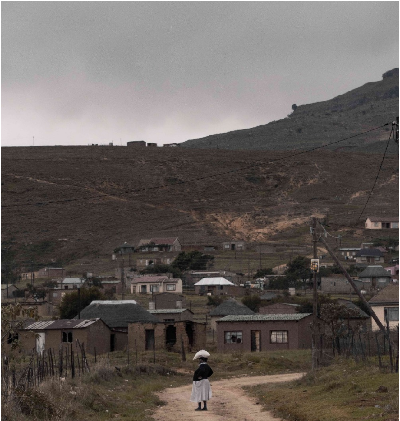
Amazizi village at a glance

Financial sustainability: this will be achieved by registering the ECD to receive the South African government grant which are specifically set aside to assist such centres. This means that the pre-school can receive an operating budget from department of social development including a meal for the children. The current grant is figure of about R145,000 bi-annually (depending on how approved) . This requires the school to;