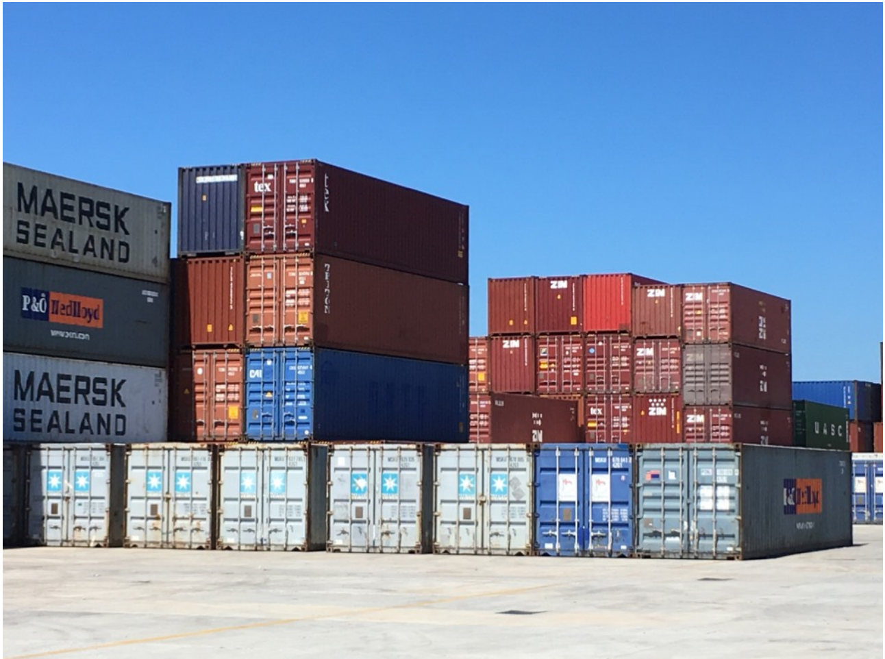
Shipping containers on standby for phase 01