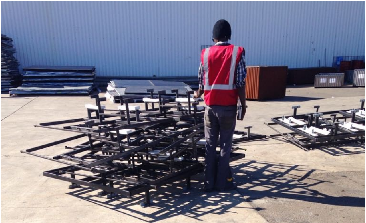
recyclable metal structure to be used in the floor raised system