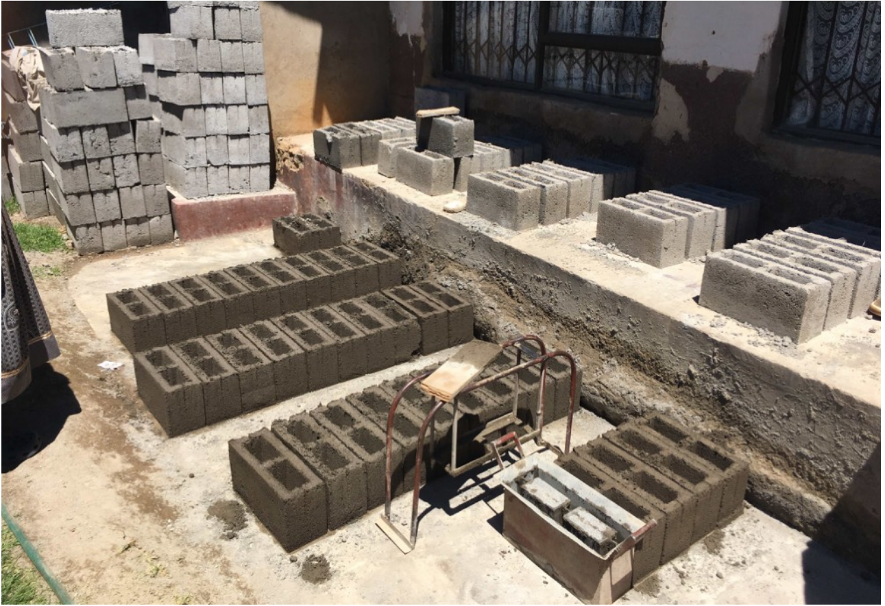
Concrete block making in Amazizi village