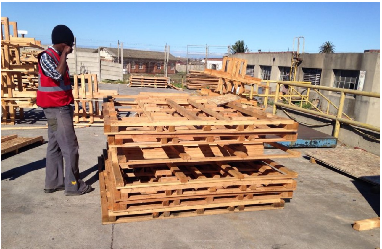
identified recyclable structural wood to be used in internal finishes