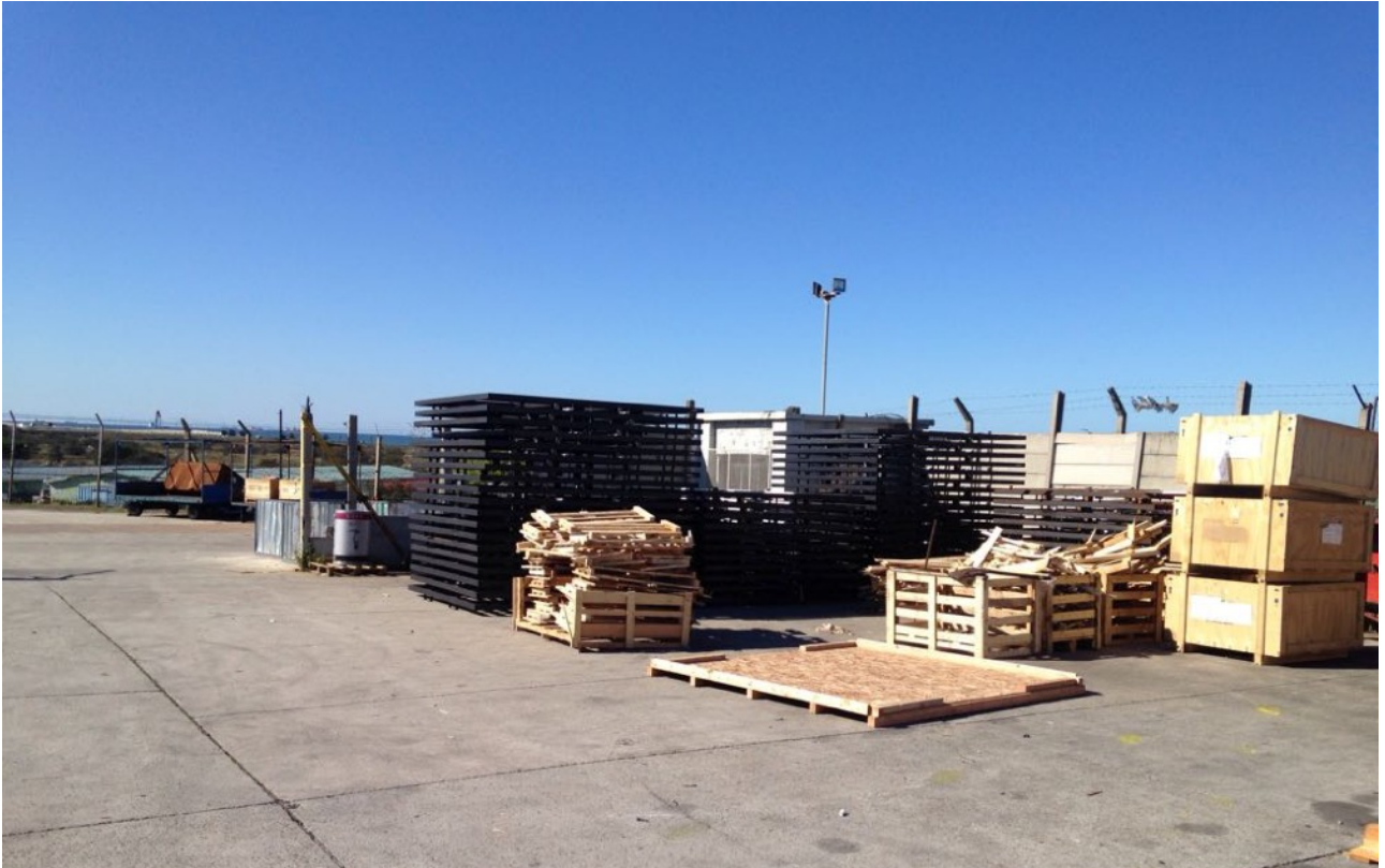
identified recyclable materials on standby to be supplied for the project