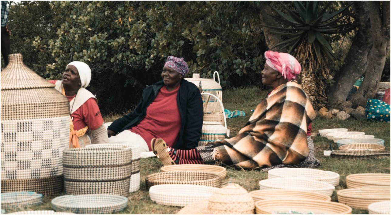
elderly Zulu women weaving for livelihood